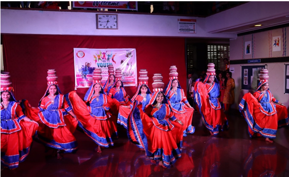
Folk dance event