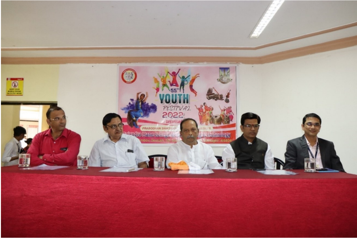
Inaugural function of Youth Festival 22-23