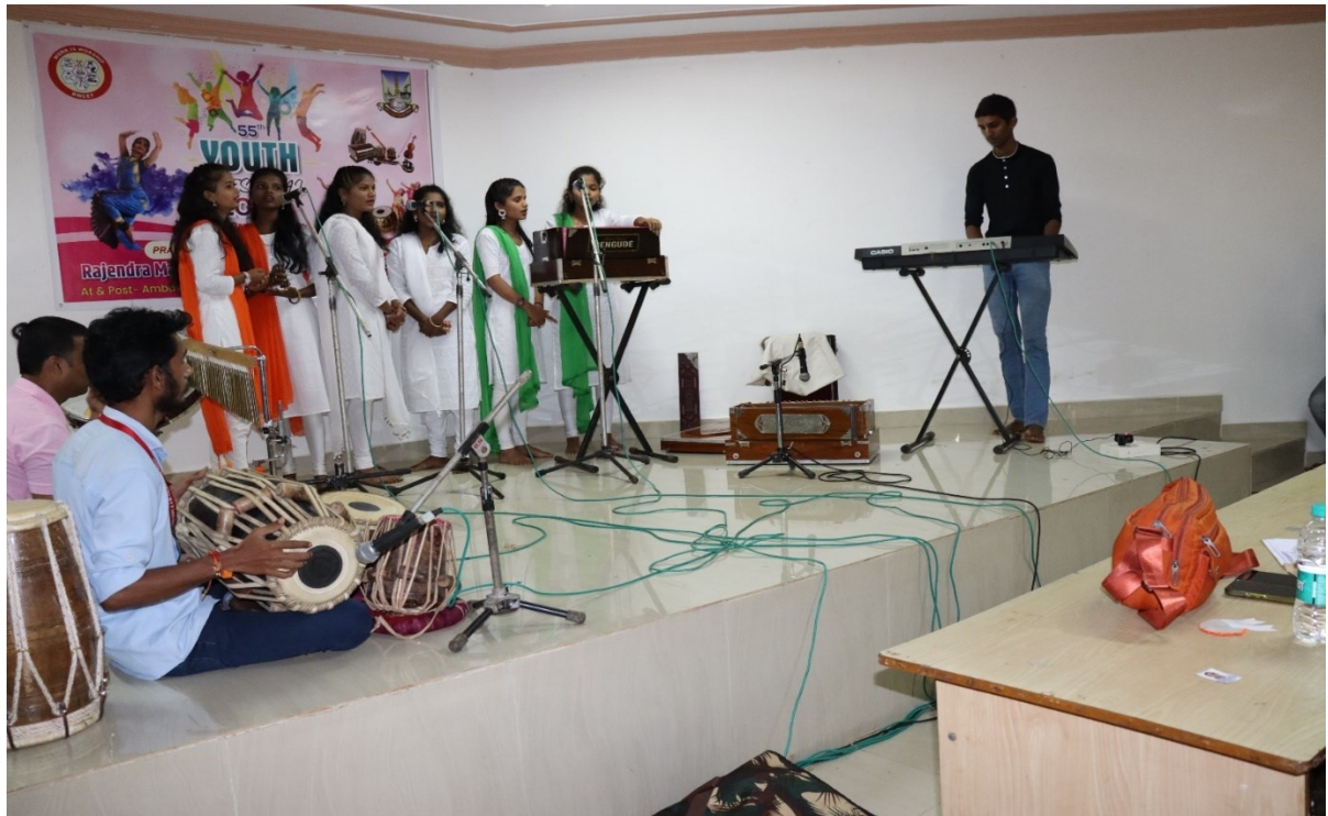
Group Singing Event